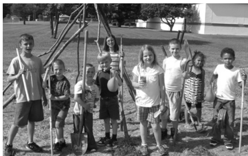
Three sisters garden planted by youth at Lyons Community Center

....communicating increase demand for winter farmers' markets and fresh produce, the Cornell Vegetable Team is working with growers on a new growing methods to increase profitability for growers selling at winter markets. Vegetable growers have indicated that their sales to be equal to or even better than the summer,