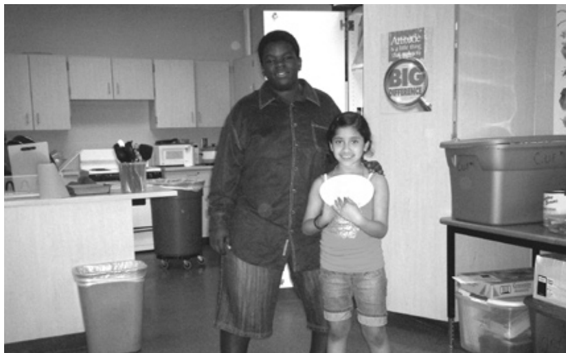
Choose Health Action Teen from Sodus with one of the youth he taught healthy living skills

allowed programs to purchase supplies and equipment and receive training and technical assistance from CCE educators. Eight youth serving organizations adopted policy and/or practice changes that support healthy eating and physical activity. This project was a collaboration with Wayne County Public Health.