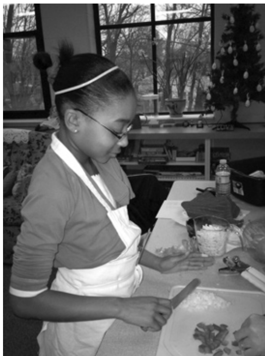
Youth practicing knife skills in "Cooking Up Fun"

...preparing teens for their next steps. Through the 4-H Teen Leader program at the Wayne County Fair, 19 teens increased their leadership, job readiness, and marketable presentation skills. 4-H also gave six scholarships to support senior 4-H members' first year of college tuition.