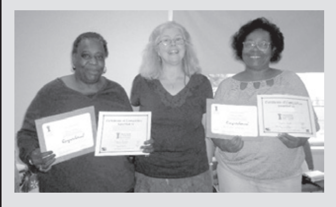
grown vegetables each year since starting the gardens. Several of the vegetables have been incorporated into the recipes prepared for class. Some locally caught fish was also added to one of the recipes with great success. They also learned how to can strawberry jam with a request for more canning classes in the future.

The first classes inspired the residents to start their own community garden on the Harvest Court property. The first year a few residents started their own small gardens. It has expanded to several residents with much larger individual gardens. They have enjoyed harvesting a variety of fresh, home